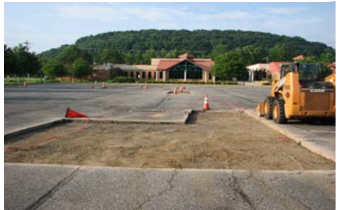
Middle School Asphalt