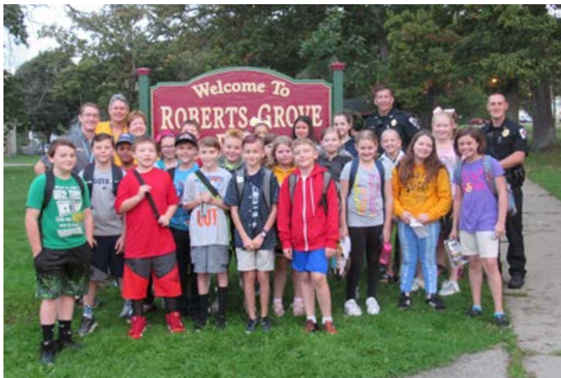
Main Street Elementary students enjoying "National Walk to School Day"

With the purchase of this equipment the, TASD has continued its vision to provide students at our schools with safe, high- quality state-of-the art fitness equipment.