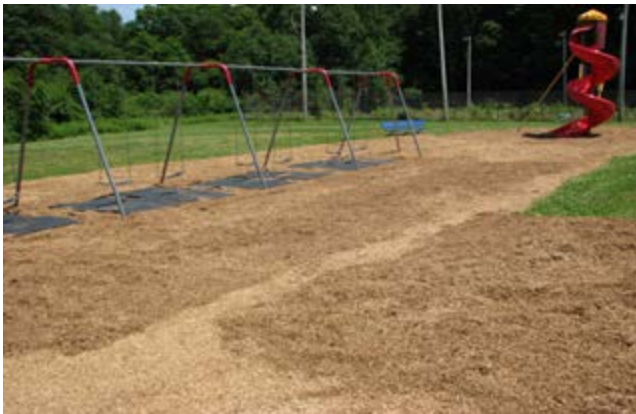
Pleasantville Playground mulching