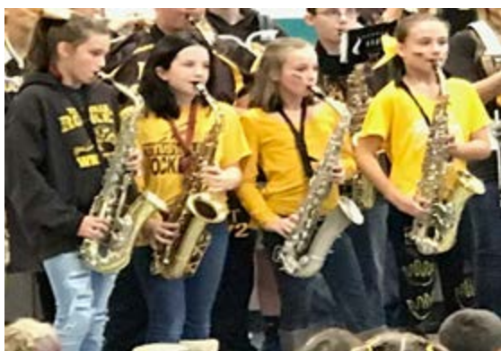
Hydetown Band students playing alongside THS Band

In an effort to offer students the ability to stay on track for graduation without re-taking a course, the high school is offering a credit recovery option. Students now have the option to only make up the work that they did not show proficiency during the face-to-face class that they took. In an effort to make sure students are able to complete all the skills that they will need for the future, credit recovery courses have been built from the existing curriculum. Students are required to make up the portion of the course that they did not find success in the first time. With this opportunity they can go to the credit recovery lab during the school year. During the summer, for the past two years, AmeriCorps members were in the school helping students do their credit recovery. Credit recovery has been a success for the past several years for many students and this is one of the many ways that Titusville Area School District is trying to meet the needs of our students.