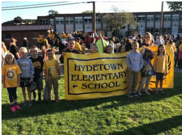
Hydetown SOAR children enjoy being in the Homecoming Parade

In the meantime, the stress of any trauma or crisis can be a problem for children and adults, and we have trained professionals ready to assist students and faculty in dealing with a crisis. The Pennsylvania Department of Education has gathered information resources for crisis response, terrorism, and mental health, including tips for parents. This information is updated frequently on the Department of Education's Crisis Response website. In addition, links to federal, state, and county safety information are available on the District website. The safety issues confronting our nation and community are serious. We know that parents, students, and staff will work together to help maintain a focus on teaching and learning in our schools as we address this continuing situation. Thank you in advance for your cooperation as we work together to ensure the safest environment for our students, staff and community.