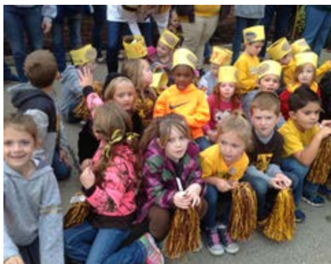
Students at the Early Childhood Learning Center