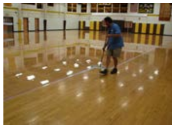
Pool renovations, custom painting, floor and grounds care, LED lighting in the THS Auxiliary gym.