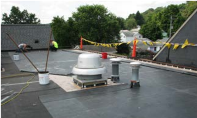
ECLC Roof Replacement

Over the summer, the Early Childhood Learning Center's roof was replaced and two new science labs were installed in the high school. All elementary school playgrounds were updated with wood or rubber mulch or pea gravel. Parking lot repairs were completed at the high school and middle school along with filling cracks and line stripping at THS, TMS, Hydetown and Main Street schools. The high school door frames were painted and custom-color painting was done on door frames and walls at Hydetown. Concrete pads were added near ECLC for easier bus access. The boiler was replaced at TMS, along with the 4-inch main entrance water line and valve. The pool has a new chemical controller, drain grates and pipes, and the surface was acid washed and repaired. Each of the custodians and maintenance staff worked proudly and diligently throughout the summer to have all the buildings and grounds ready for the return of staff and students.