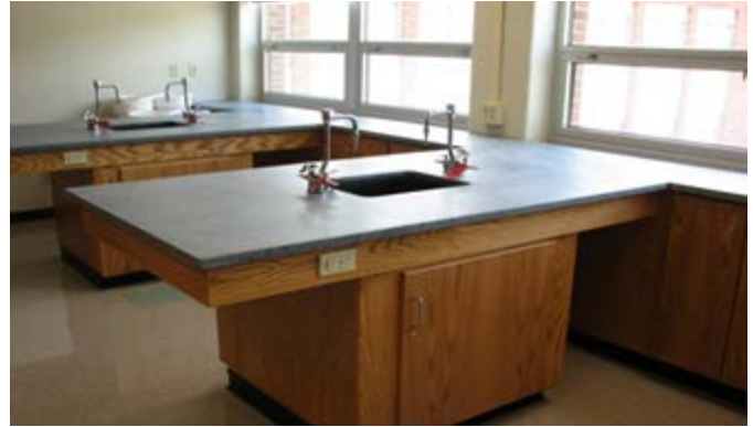
Two new science labs at the high school